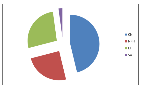
Figure 2: Pie chart shows distribution of cases in category II

While evaluating the results, the commonest pattern noted was of category II, which showed that most lesion were benign on FNAC and did not require surgical intervention. 93 cases included Colloid nodule, Nodular Follicular Hyperplasia, Lymphocytic Thyroiditis and Subacute Thyroiditis.